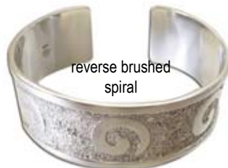
reverse brushed spiral