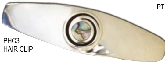
PHC3 HAIR CLIP