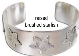
raised brushed starfish