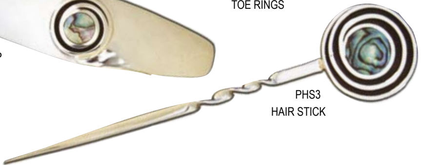
PHS3 HAIR STICK