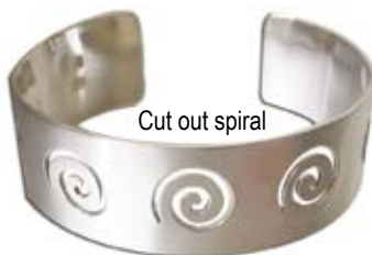
Cut out spiral